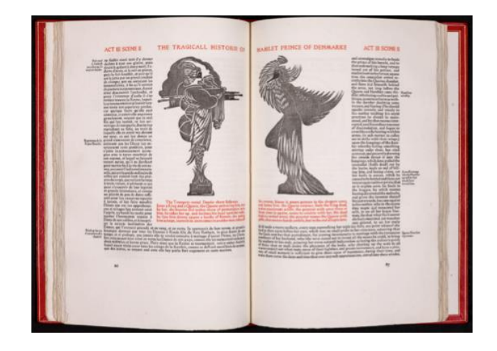
Cranach Press Hamlet

While the Library's chief motivation has always been to record and promote research into the dissemination and