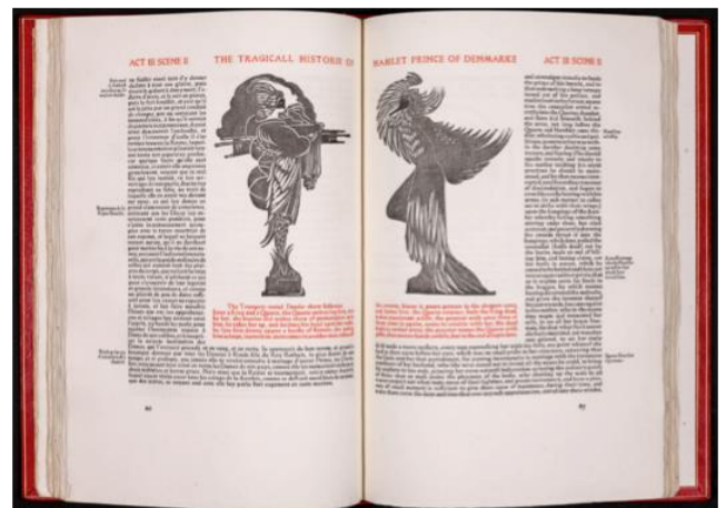
Cranach Press Hamlet

While the Library's chief motivation has always been to record and promote research into the dissemination and